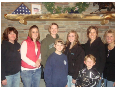
New Members from Oct. 2010 - Present: